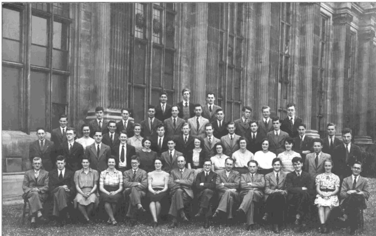
KCL Physics students and staff outside the Royal Fort, Bristol, 1943